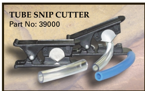
TUBE SNIP CUTTER Part No: 39000

In permeability to moisture, HYTREL is comparable to the poly-ether based urethanes. Because of its low permeability to refrigerant gases and hydrocarbons, HYTREL is an excellent choice for use in refrigerant hose or in flexible hose or tubing to transmit gas for heating and cooking.