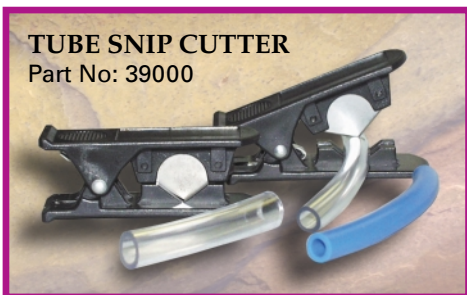
TUBE SNIP CUTTER Part No: 39000

Also available, Excelon Micro-Line Laboratory Kit (Part No: 18649). Each kit contains 100 feet of each Micro-Line size, 5 spools in total. Our Laboratory Kit is the best way to become acquainted with the many advantages of Micro-Line.